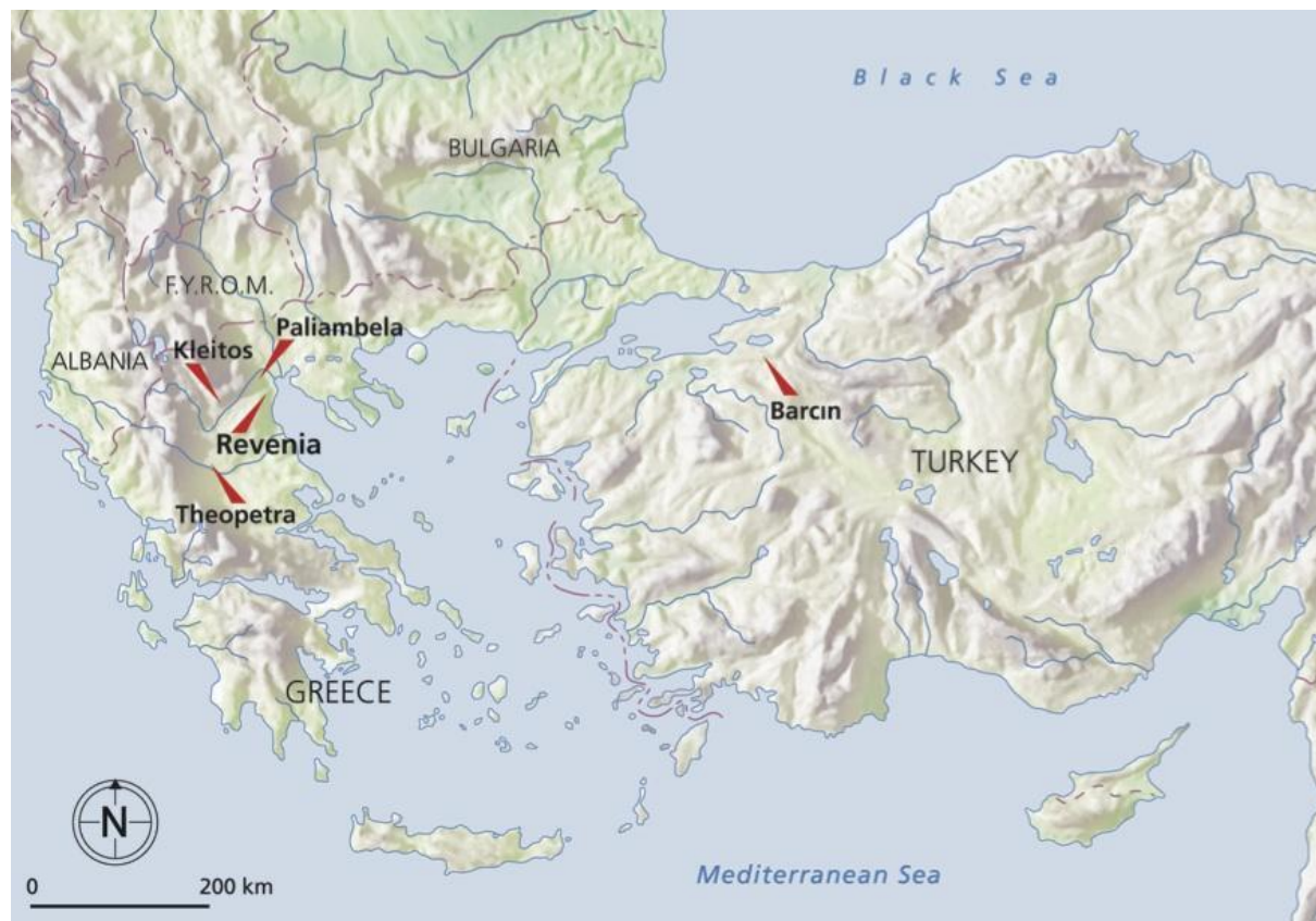
Figure 1: North Aegean archaeological sites investigated in Turkey and Greece.

Early Greek Neolithic sites, such as Franchthi Cave in the Peloponnese (14), Knossos in Crete (15) and Mauropigi, Paliambela and Revenia in northern Greece (16-18) date to a similar period. The distribution of obsidian from the Cycladic islands, as well as similarities in material culture, suggest extensive interactions since the Mesolithic and a coeval Neolithic on both sides of the Aegean (17). While it has been argued that in situ Aegean Mesolithic hunter-gatherers played a major role in the ‘Neolithisation’ of Greece (14), the presence of domesticated forms of plants and animals is a good indication of extra-local Neolithic dispersals into the area (19).