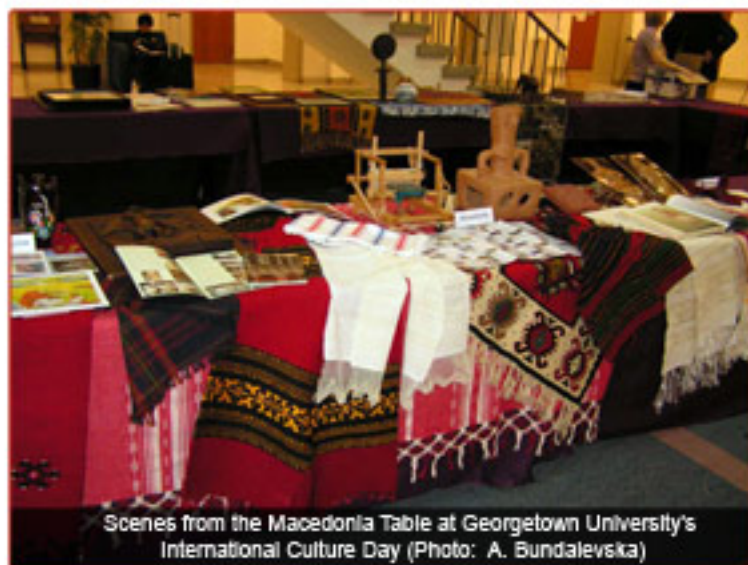
Scenes from the Macedonia Table at Georgetown University's International Culture Day

Promoting our culture is a way of making a statement about our national identity. This spring, UMD members enthusiastically represented Macedonia at several cultural events in the Washington, D.C. metropolitan area.