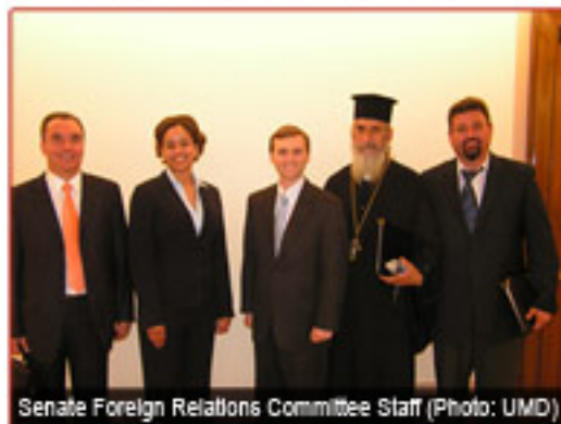
Senate Foreign Relations Committee Staff