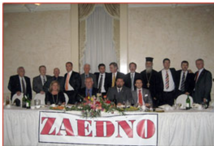
Group Picture of the MHRMI and delegates

Macedonian Human Rights Movement International (formerly Macedonian Human Rights Movement of Canada) has been active on human rights issues for Macedonians and other oppressed peoples since 1986. The organization was formed in response to the "Manifesto for Macedonian Human Rights, the Movement for Human and National Rights for the Macedonians of Aegean Macedonia", released in 1984 by the Central Organizing Committee for the Macedonian Human Rights in Salonica, Greece.