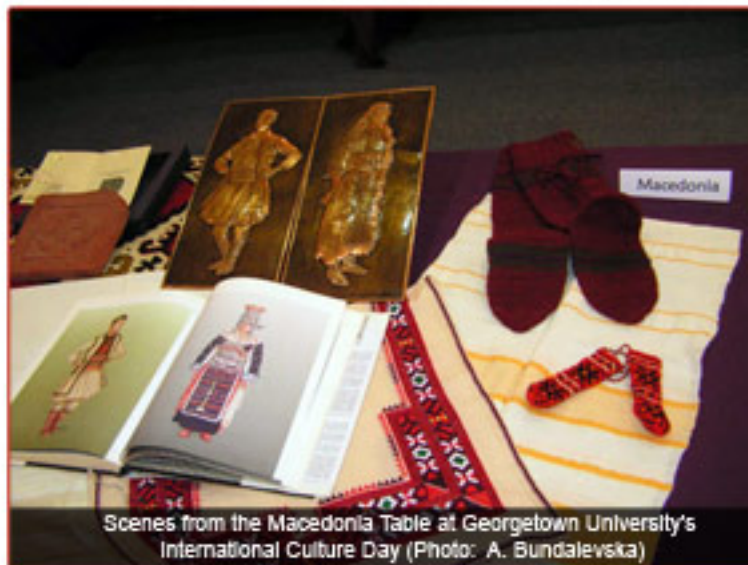
Scenes from the Macedonia Table at Georgetown University's International Culture Day

Military personnel and their families at the Fort Myer Military Base in Arlington, Virginia were able to taste delicious traditional cuisine, see century old historic artifacts, colorful Macedonian textile and costumes, and be entertained by Macedonian folk music. UMD volunteers alongside embassy staff were available to answer various questions about Macedonian history, geography, and tourism to the many interested visitors at this multicultural event.