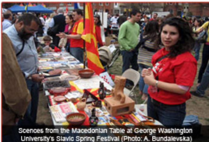
Scenes from the Macedonian Table at George Washington University's Slavic Spring Festival