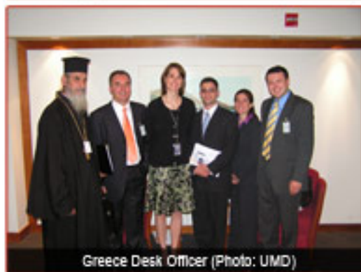
Greece Desk Officer