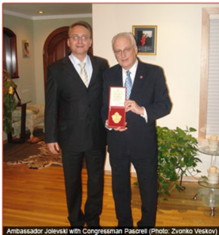
Ambassador Jolevski with Congressman Pascrell