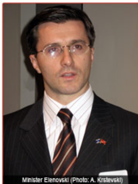
Minister Elenovski

NEW YORK CITY—Macedonian Minister of Defense Lazar Elenovski was honored by members of the diaspora at a reception hosted by United Macedonian Diaspora ("UMD") on January 30th 2007. Minister Elenovski, who was in the country meeting with U.S. government officials about Macedonia's progress towards NATO, thanked UMD for promoting Macedonia's efforts through the Macedonia in NATO '08 campaign. He expressed his satisfaction with his country's progress, saying "NATO membership will be the second major historical event of Macedonia, second to independence," and called upon to the diaspora to continue mobilizing in support of their homeland.