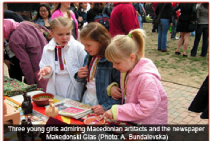
Three young girls admiring Macedonian artifacts and the newspaper Makedonski Glas