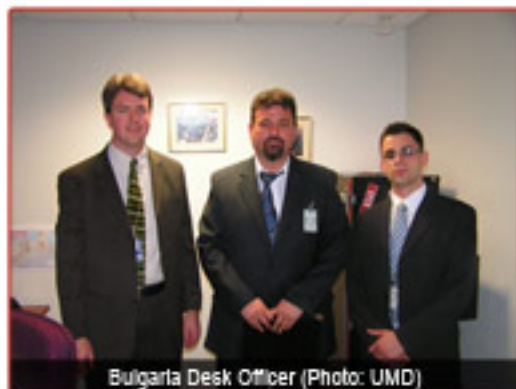
Bulgaria Desk Officer