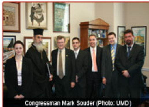
Congressman Mark Souder