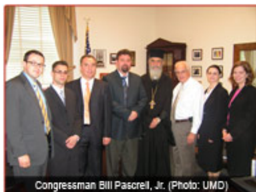
Congressman Bill Pascrell, Jr.