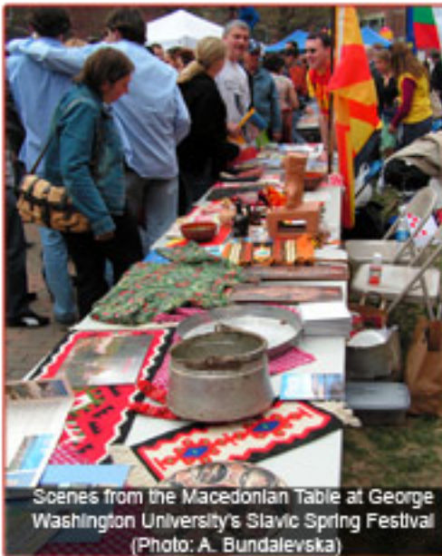
Scenes from the Macedonian Table at George Washington University's Slavic Spring Festival

We encourage Macedonian artists, linguists, ethnographers, historians, and musicians to contact us at info@umdiaspora.org to discuss future possible collaborative projects.