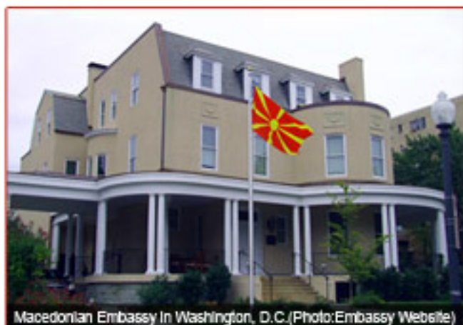
Macedonian Embassy In Washington, D.C.