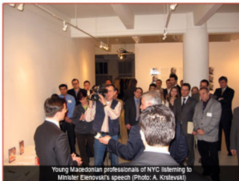
Young Macedonian professionals of NYC listening to Minister Elenovski's speech

public and policymakers of the progress being made by Macedonia and their efforts to secure democratic reforms and to be a role model for the rest of the Balkans."