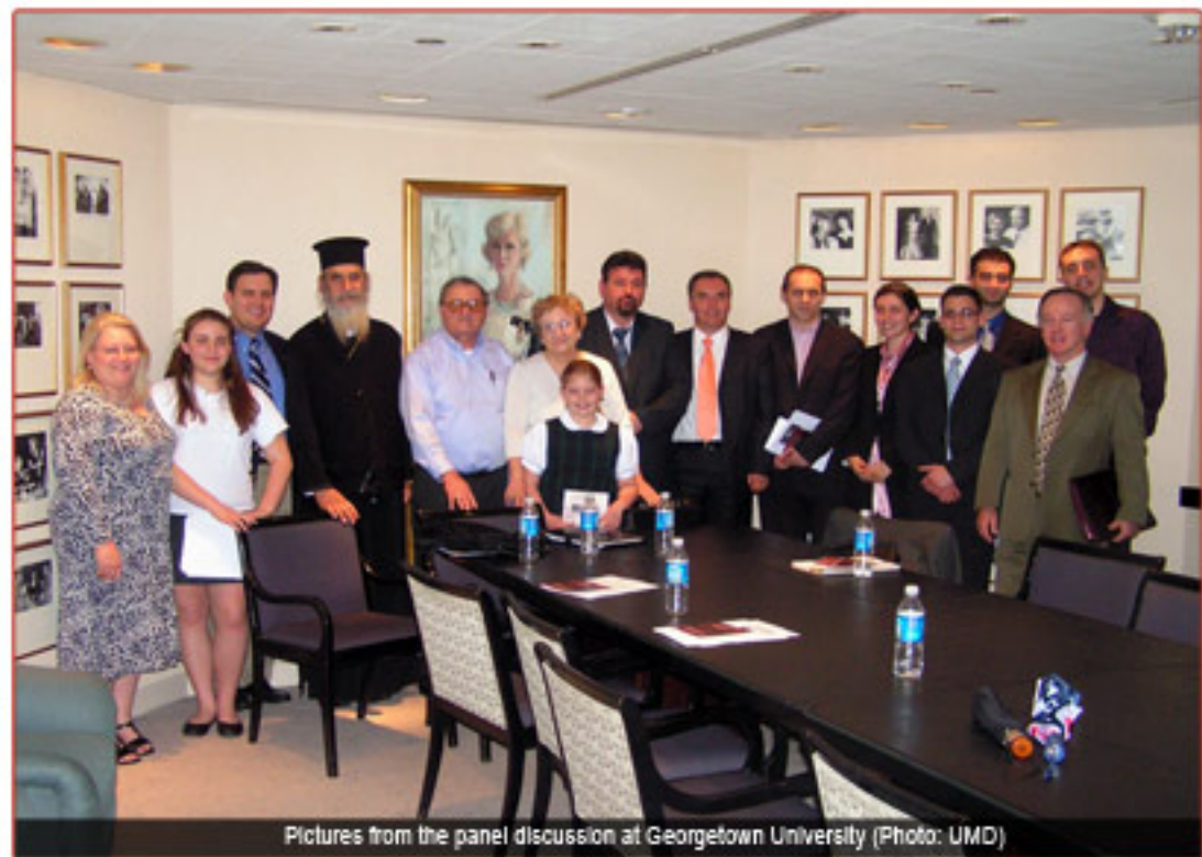
Pictures from the panel discussion at Georgetown University

That evening, UMD held a panel discussion on "the Status of the Macedonian minorities in the Balkans" in the Intercultural Center at Georgetown University. Turnout was higher than expected and several in the audience expressed sincere interest and concern at the topics being discussed.