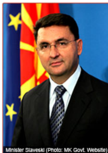
Minister Slaveski

WASHINGTON, D.C.—On Thursday, April 12, 2007, members of the United Macedonian Diaspora met with Macedonian Finance Minister Dr. Trajko Slaveski to discuss the economic situation in the Republic of Macedonia, including ways by which diaspora Macedonians can assist the economic development of Macedonia. The meeting was held at the Embassy of the Republic of Macedonia.