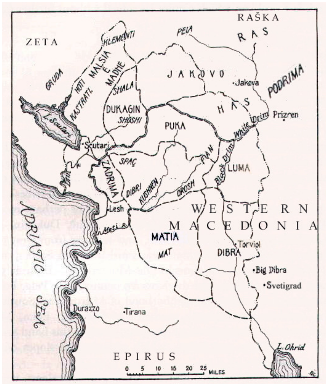
Above: a map showing Western Macedonia and the region of Matia ( Mat ). Note the typical Macedonic pair-named toponyms: Has - Ras (principality of Raška), Podrima - Zadrina (respectively “Along the Drim” and “Behind the Drim”) 16 , Black Drim - White Drim (the rivers), Dibri - Dibra, Matia - Dalmatia (in northwest), etc.