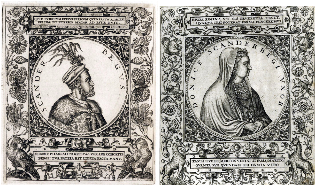
Above: the portraits of Skanderbeg and his wife Donka

order to obtain assistance and to consolidate his domains. To repay his debt toward Alfonso (Ferdinand's I father) for the financial and military assistance given to him in the years before, Skanderbeg took up the pope's pleas to help out Alfonso's son by sending a military expedition of 500 Macedonian cavalry to Italy. This ties with the papal state and other western kingdoms also says a lot about his religious affiliation. Although it is presumed that he was of Orthodox Christian credo 12 , because the region of Matia was still part of the Diocese of Macedonia (Orosh eparchy), it is noted that he was in close relationship with Catholic church too. Also, both pope Calixtus II and his successor Pius II supported him financially, while planning a crusade against Turks. Because of his merits in the war against the Turks pope Calixtus even gave to Skanderbeg the title Captain-General of the Curia. 13