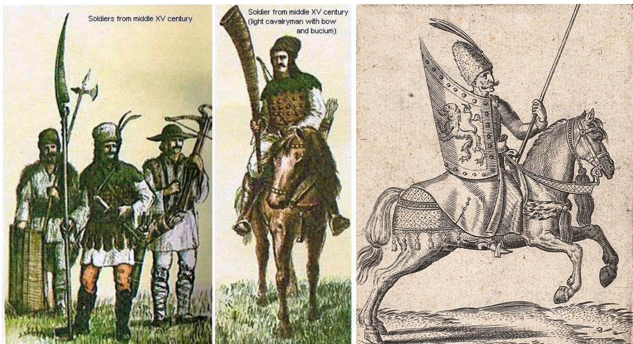
Above: Macedonian foot soldiers and horsemen from 15th century

Ottoman arrival. - Murat's force contained approximately 80,000 men and two cannons, which could fire 200 pounds (91 kg) cannon balls. His army also contained a fresh corps of Janissaries, and 3000 debtors and bankrupts obligated to fight in order to regain their freedom. In charge of the Svetigrad defense was the voivoda Petar "Perlati" (the ' Conveyed ' in Latin), renown Macedonian chieftain, with some 3000 strong men. Thus, in total, 15,000 Macedonians faced 80,000 Turks. The Ottoman force paraded around the fortress and offered 300,000 aspras (Turkish currency) to those who would open the gate and let the Ottoman army in the fortress without a fight. The heralds proposing these offers went into the fortress at night time and the garrison commanders gave them a splendid dinner, so that they would get the impression that the enemy was well prepared for a lengthy siege. After the dinner their offers were rejected and they were sent back to the sultan. The size of the Ottoman army troubled Skanderbeg because of the effects it could have on the morale of his soldiers and on the local population which supported the fighters. Skanderbeg thus moved from village to village, disguised as a common soldier, and invoked the fighting spirit of the population. As a result of this activity, even if heavily outnumbered, the local chieftains agreed to fight the Turks and persuaded Skanderbeg to draw up his plans in concert with theirs.