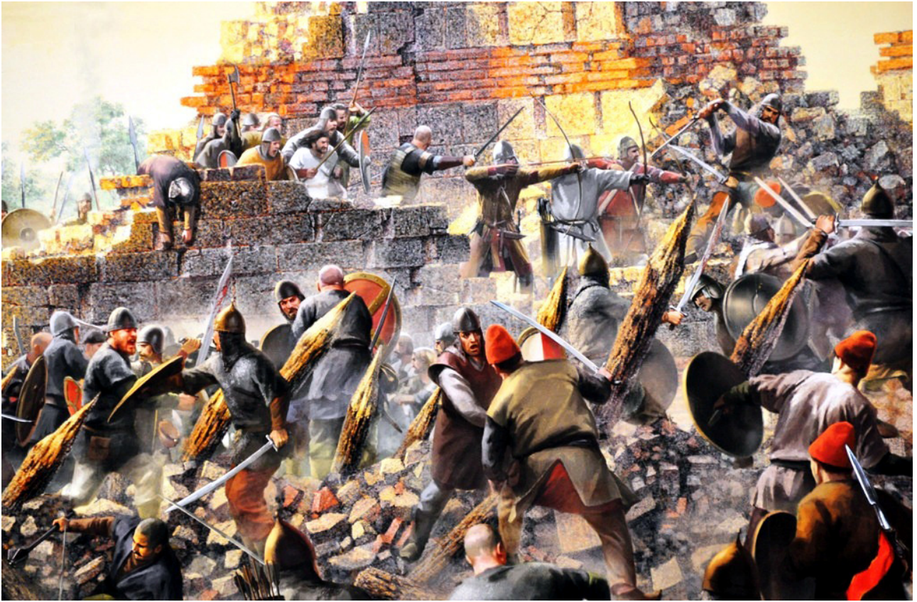
Above: attack of the Turkish Janičari troops