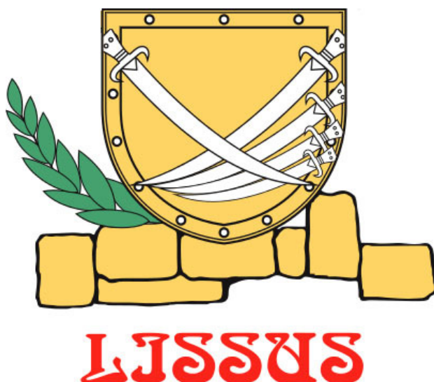
Above: the modern Coat of Arms of the city of Lesh ( Leche , Lezhe , Lissus )