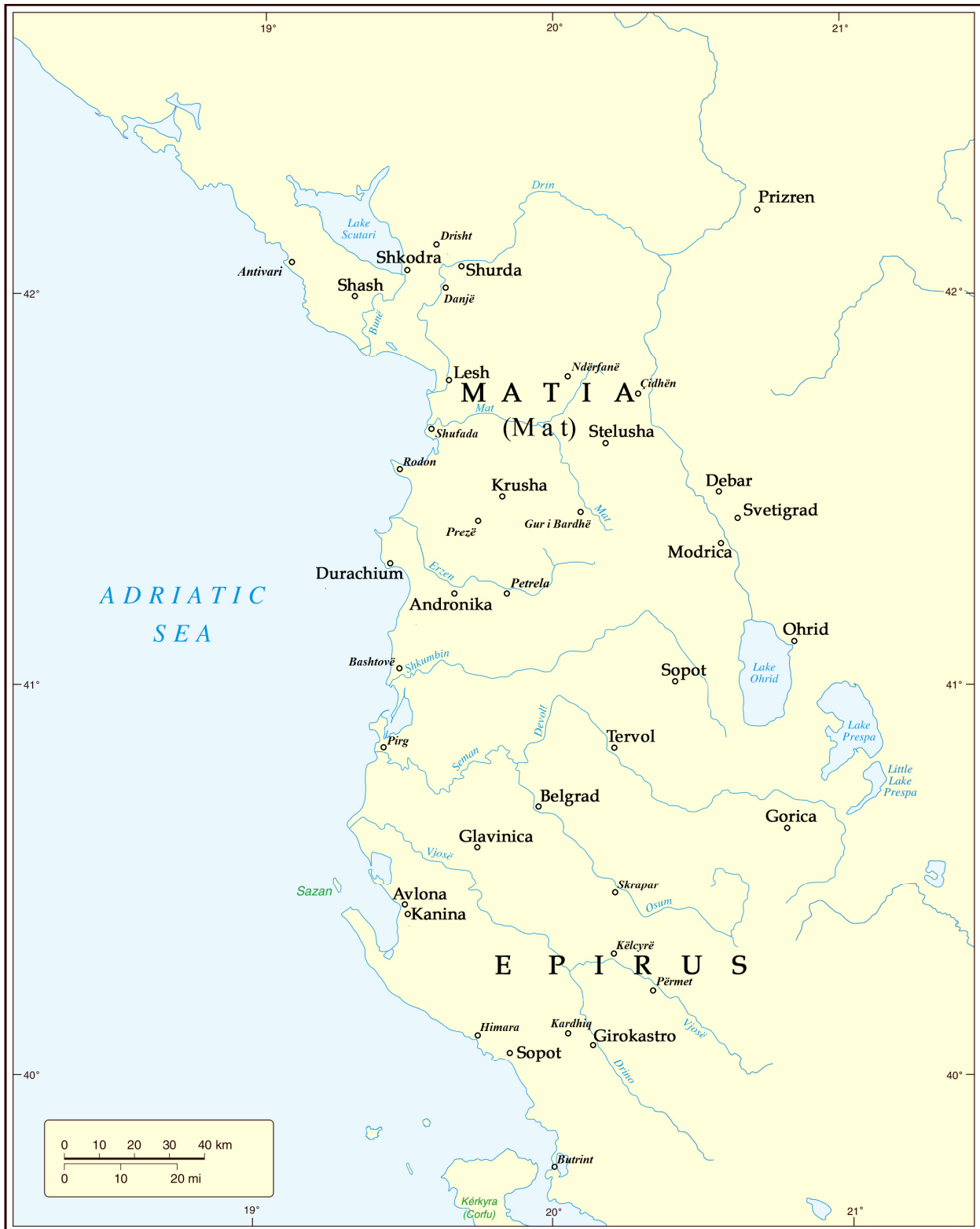
Above: map of Matia and Epirus with old Macedonic names of the cities used before 19 th century