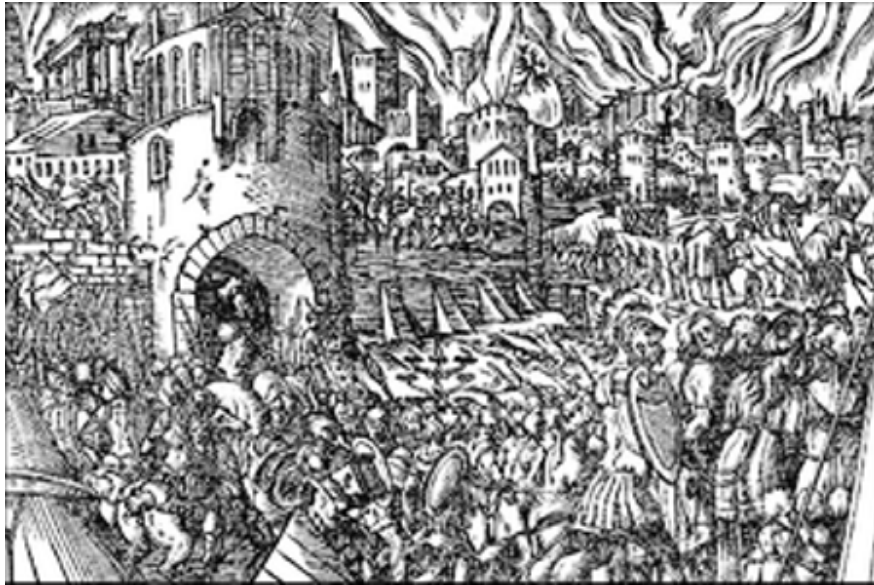
Above: the siege of Kruša in 1450

Pope Pius II's declared a crusade against the Ottoman empire in November 1463, but to no avail, as the major European powers were reluctant to join the pope's crusade. Among those inquired were the city of Florence, Francisco Sforza of Milan, Louis XI of France, and Ferdinand I of Naples, all of whom declined for their own reasons.