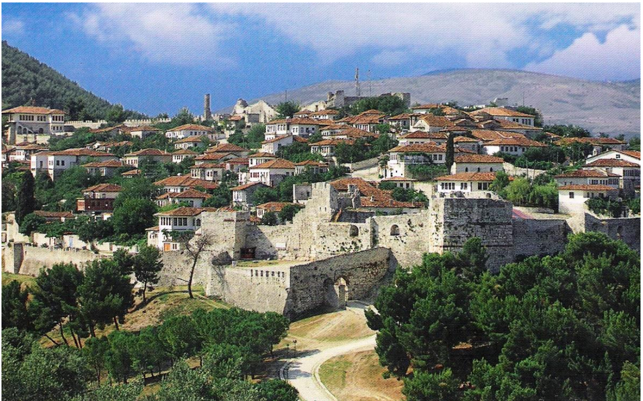
Above: the city of Belgrad, i.e. 'White City' (today ' Berat ') in Matia

The loss of Svetigrad has further undermined the League of Leshi, and allowed to the Ottomans easy access into the region of Matia from east. They could now launch three coordinated invasions from south, southeast, and northeast into Epirus and Matia. A few weeks after the siege, Mustafa Pasha led 15,000 men into Matia, as requested by Skanderbeg's Venetian rivals, only to be heavily defeated with Mustafa being captured. Skanderbeg tried to regain Svetigrad the next year, but he did not have the proper artillery to do so. He surrounded the fortress, but he realized that his position was hopeless and lifted the siege. In early 1450 the Turks would take Belgrad (today ' Berat ') through a night-time stratagem, and later that same year Murat II would besiege Kruša for first time, without success again.