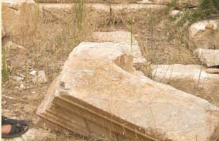
A monumental grave building in ruin on the foot of Drenovska Klisura, a possible place of a large city cemetery

During the Second war with Rome, Macedonia around Stobi was often troubled by the incursion of Dardani. According to Livy (59 BC – 17 AD), Philip V in 183 BC decided to found a city in Deuriopus, near the Erigon River, not far from the ancient city of Stobi. To the new city he ordered the name of Perseida to be given, so as to show honor to his elder son. It is very likely that Bryanium as an already existing city of strategic importance was renamed to Perseida, since the city was in need to be rebuilt and better fortified. However, Perseida in short period of time was renamed to