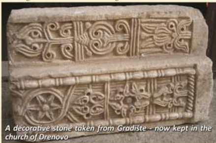
A decorative stone taken from Gradište - now kept in the church of Drenovo