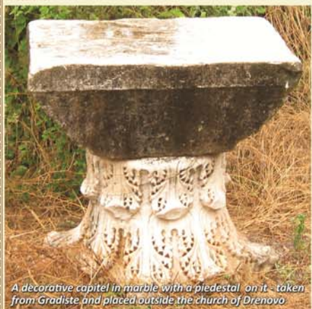
A decorative capital in marble with a pedestal on it - taken from Gradište and placed outside the church of Drenovo

In the village of Drenovo there is an old church that was built for Tsar Dushan and finished with the paintings shortly after his death in 1356. The badly damaged church during the Turkish rule of Macedonia was restored by Mile Sazdov and his villagers in the beginning of the XIX centuries. Then, the villagers from Drenovo for the rebuilding of the church also brought building materials from Gradište; the marble columns, capitals and fundaments quarried from a ruined episcopal basilica that are now to be found in the church, outside it and elsewhere scattered in the village of Drenovo.