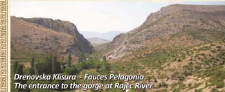
Drenovska Klisura - Fauces Pelagonia The entrance to the gorge at Rajec River

Our written sources about existence of Bryanium at the village of Drenovo are quite obscure. Strabo (64 BC – 24 AD) in his work Geography tells us that Bryanium, Alcomenae and Styberra were among the most populous cities on the Erigon River in Deuriopus district. Obviously, Deuriopus must have covered the whole region alongside the Erigon River as almost does Rajec today that during the Turkish reign of Macedonia was treated as a separate administrative unit called River Parish. Our assumption that Bryanium existed as a city in the past on the site of Gradište near by the hill of Devol is mainly based on the extensive occurrence of the archaeological finds and its strategic location at the gorge of Drenovo on the important road from Stobi to the interior of the Macedonian Kingdom.