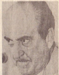
Дали Грција има „авторско право“ на името Македонија: Мицотакис

Мицотакис: Никој нема авторско право на името Македонија. Македонија е географски белг. Еден дел од Македонија – 50 проценти и припаѓа денес на Грција, друг дел на Бугарија и трет на Скопје. Тоа е реалноста. Земјите од Европската заедница се обврзани оваа Република да не ја признаат сè додека признавањето со името не се реши. Зошто да се понижи