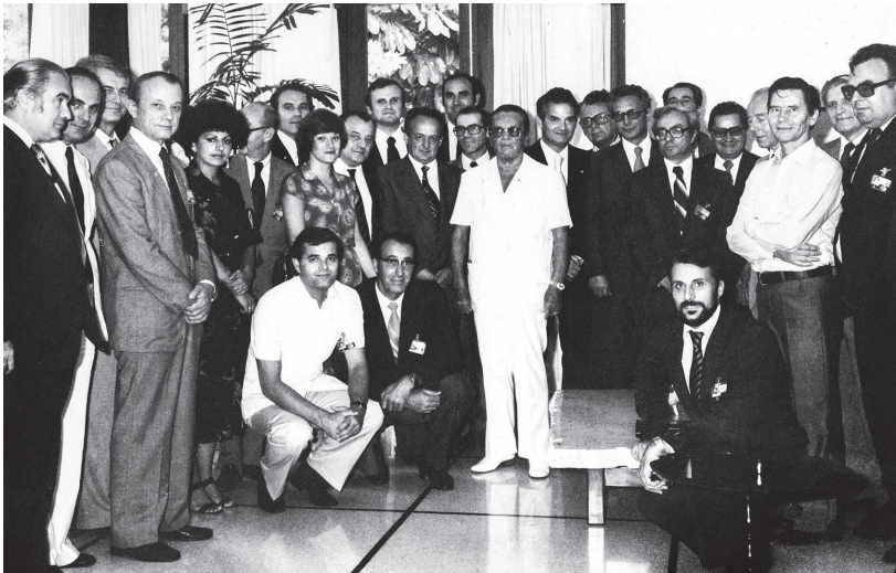
Below: The Yugoslav delegation, which participated at the 6th Summit of the Non-Aligned Countries in Havana, Cuba, together with Tito, at the end of the summit, in 1979