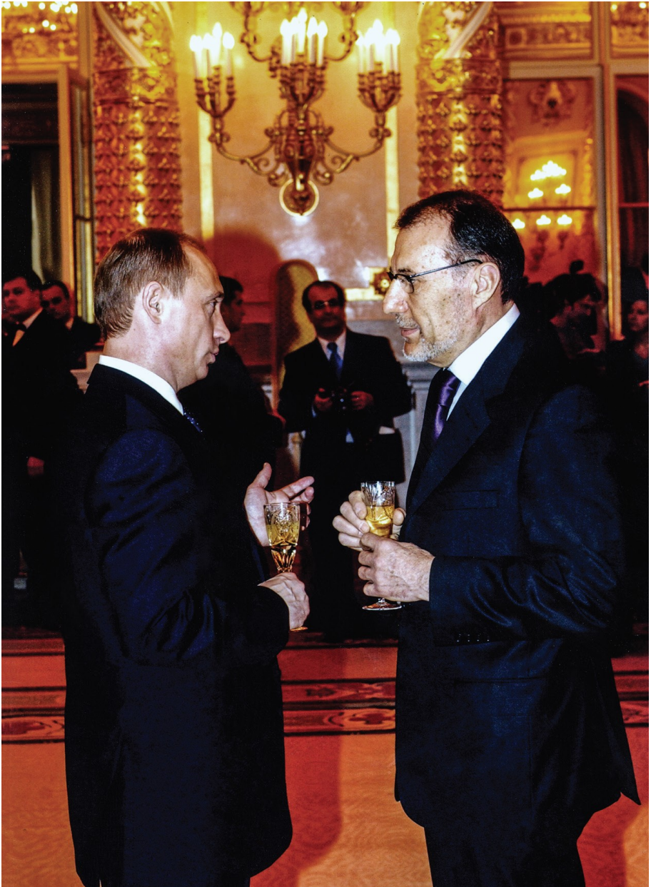
With Russian President Vladimir Putin in the Kremlin, after presenting his credentials, in 2004