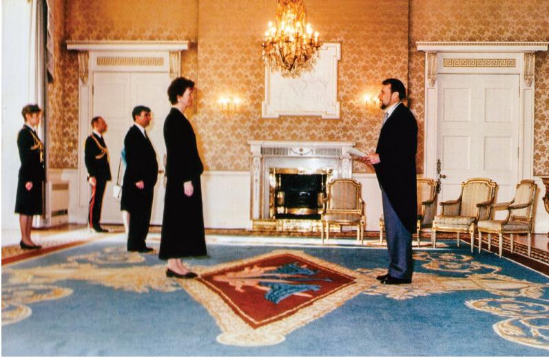
Above: Presentation of credentials to the President of Ireland, Mary Robison, in Dublin, 1994 Below: Military honours in Dublin, during the presentation of credentials