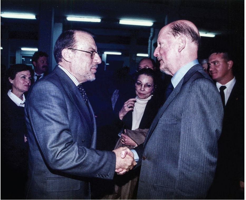
In Ohrid, in 2003, as host to the Bulgarian Prime Minister, former Emperor Simeon II of Saxe-Coburg, on a trip through Macedonia