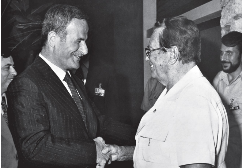
Above: In Havana, Cuba, at a meeting of President Tito, with Syrian President Hafez El Assad, in 1979