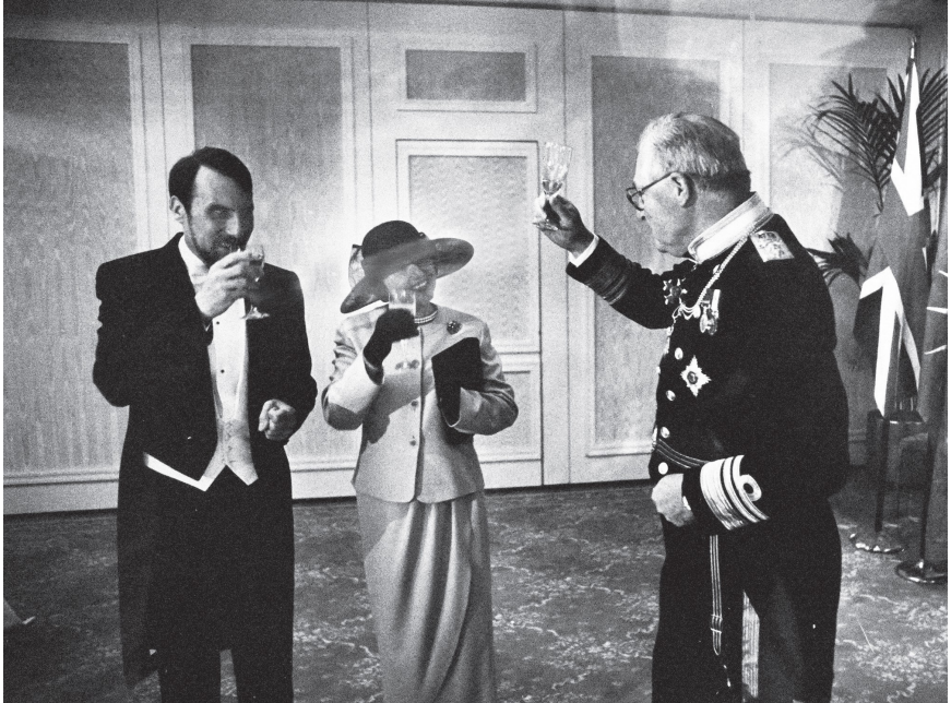
After presenting credentials to the British Queen, Elizabeth II, at Buckingham Palace, toast from the Marshal of the Court, 1994