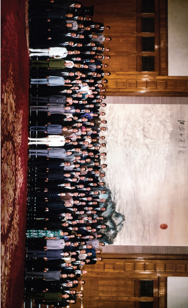
In 1977, in Beijing, with Tito and Deng Xiaoping, the man who took China from the 19th to the 22nd century, as the greatest world wonder of all time