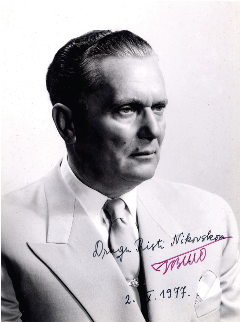
Dedication by Tito, in Beijing, in 1977