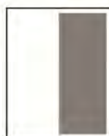
1/2 Page (vertical)