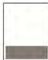
1/4 Page (horizontal)