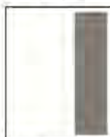
1/3 Page (vertical)