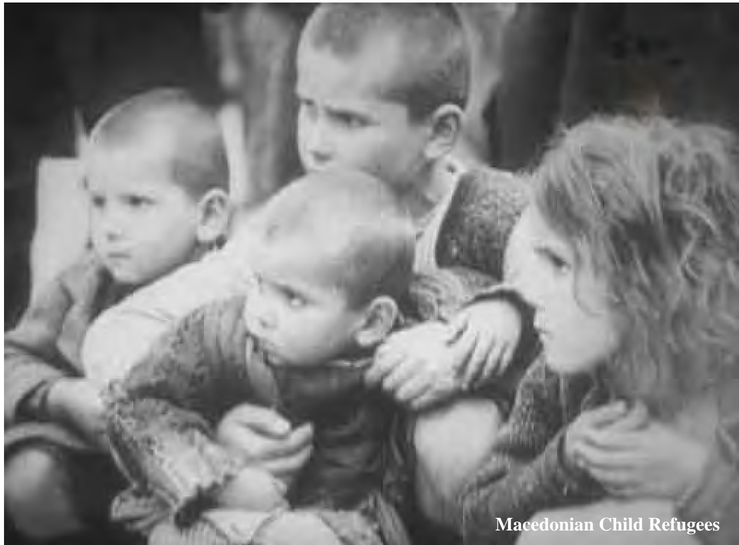
Macedonian Child Refugees