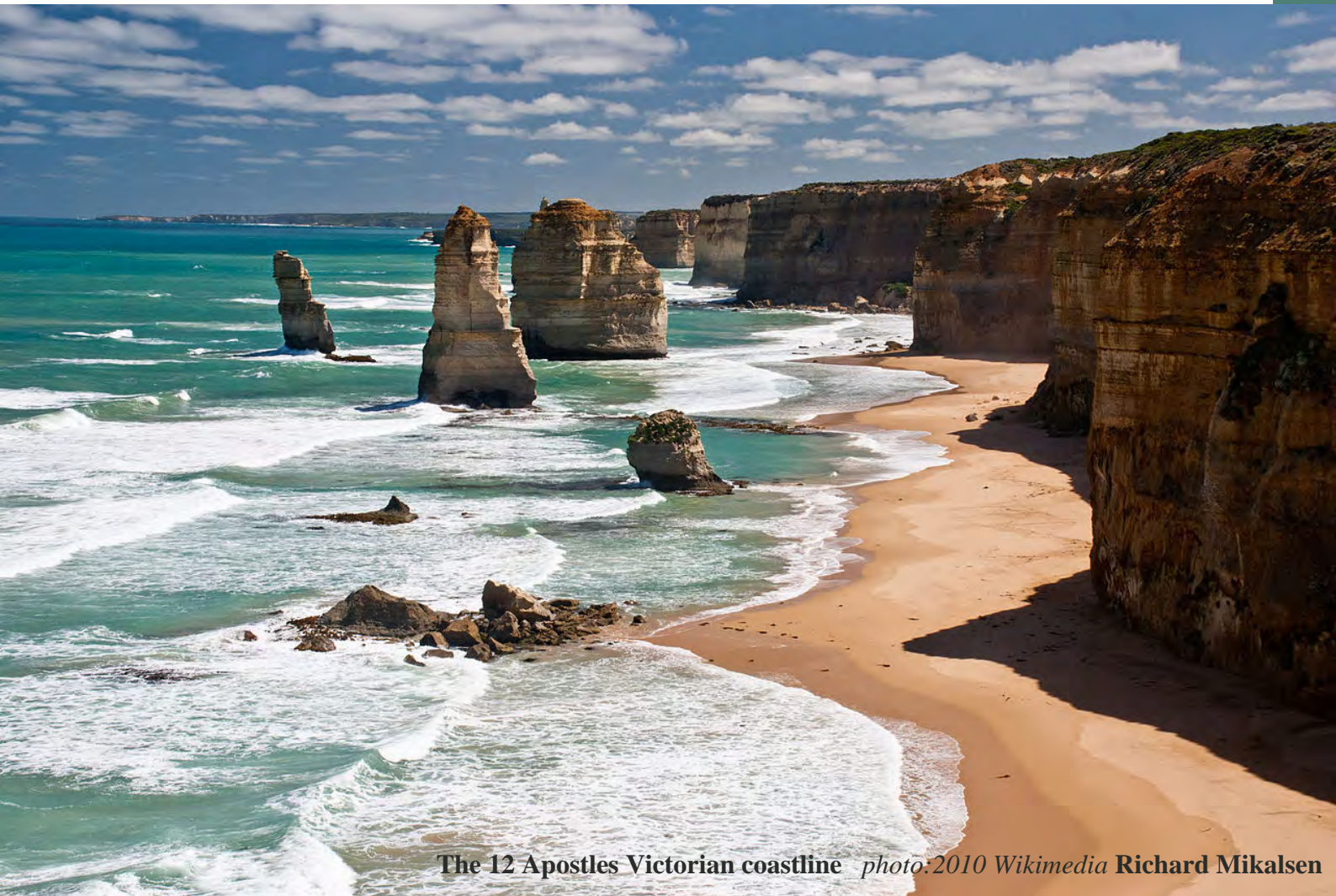
The 12 Apostles Victorian coastline