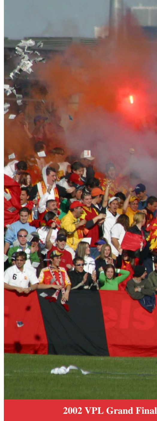
2002 VPL Grand Final

CT> Sure was mate. That amazing match against Fawkner is still regarded as the greatest Victorian Premier League Grand Final ever, and really was the catalyst for re-sparking my interest in the club back then. Ever since Preston was relegated from the NSL at the end of 1993, like many people my interest in the club waned. I attended a few games here and there against the bigger teams like Heidelberg, Green Gully and Altona Magic, but it wasn't the same as before. Then in 2002 when the club looked headed for relegation half way through the season, they went on an amazing run to fall into the finals by the barest of margins on goal difference. Every game during that finals series was an elimination final, and as the weeks went on we just kept winning in the most amazing fashion with last minute goals and extra time winners. Then on Grand Final day the fairytale came true. A golden goal in extra time and the crowd went nuts! I still re-