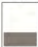
1/3 Page (horizontal)