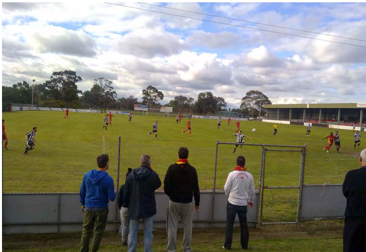
Only true supporters make up a dismal final game crowd at B.T. Connor Reserve 2014

CT> Look, to an extent I feel the same way. I'll watch a good A-League game on TV, but I really don't have much interest in going to the games or supporting a club and buying a membership. But that's because I didn't grow up supporting any of those teams, I just don't feel that same connection like I do with Preston. Also as you say, these A-League clubs are private entities and not member-based organisations, which means you don't really have any rights or a say in the future of the club. That's what's great about our club, every member is a stakeholder and gets a vote. Don't get me wrong, I think the A-League has done many great things for the game as a whole to give it mainstream attention. So it does have some great things going for it. But I don't necessarily think the quality of football (or the players) is any better now than it was during the National Soccer League era, in fact sometimes I'd argue it's not as good, however that's an argument for another time. But for the kids growing up today, the A-League is what they know, so a Melbourne Victory or Melbourne City to them is the same as what Preston was to us back in the 80s. I just hope their parents remind them about all the good things we have at Preston and keep that flame burning inside of them for future generations.