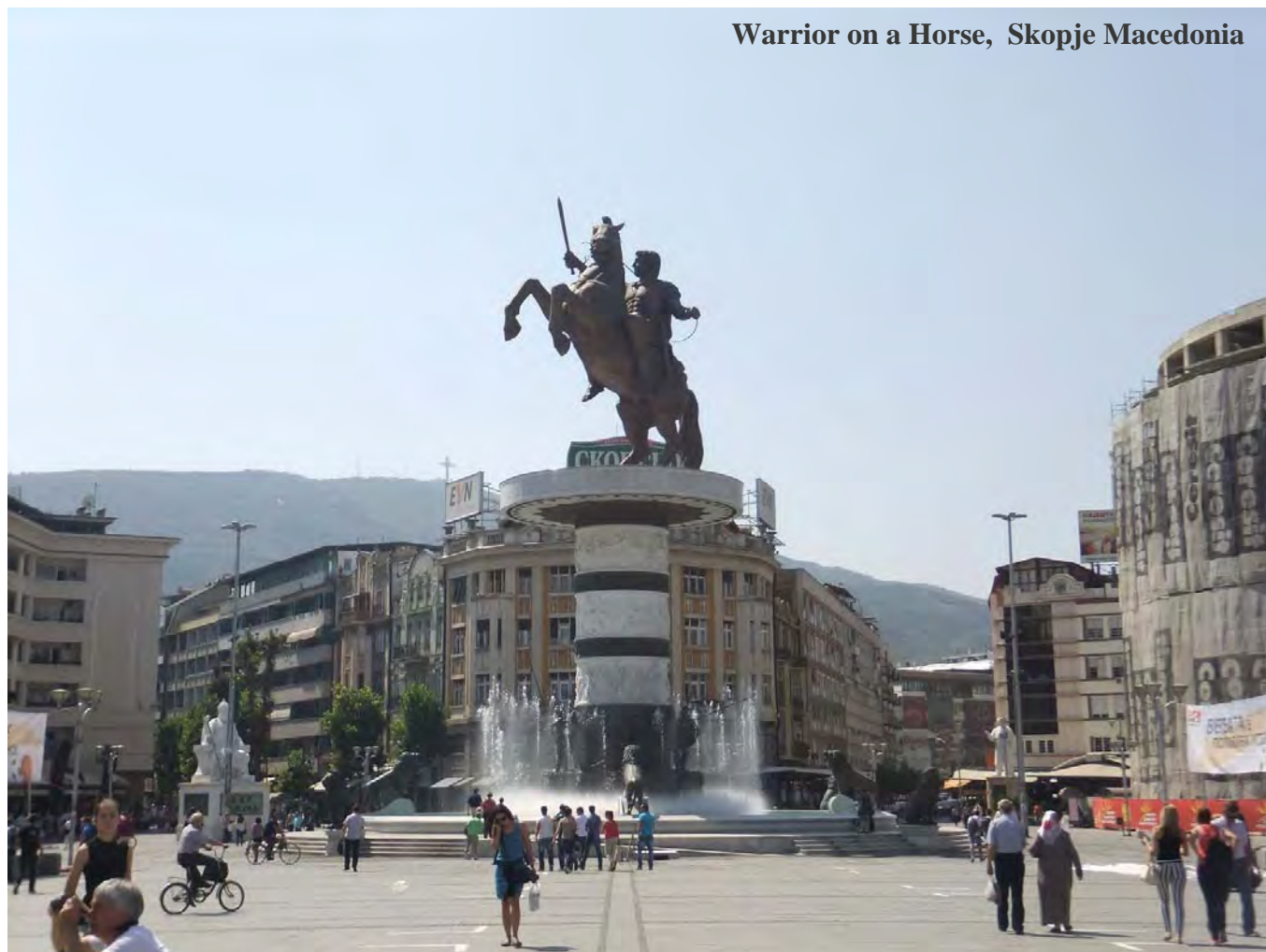
Warrior on a Horse, Skopje Macedonia

Scholars have noted that the Marko of legend "used not only his strength and prowess but cunning and trickery. Despite his extraordinary qualities he was not depicted as a superhero or a god, but as a mortal man. There were