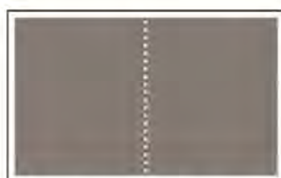
Double Page Spread