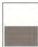
1/2 Page (horizontal)