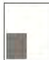
1/4 Page (corner)