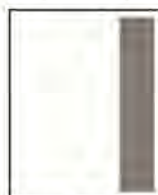
1/4 Page (vertical)