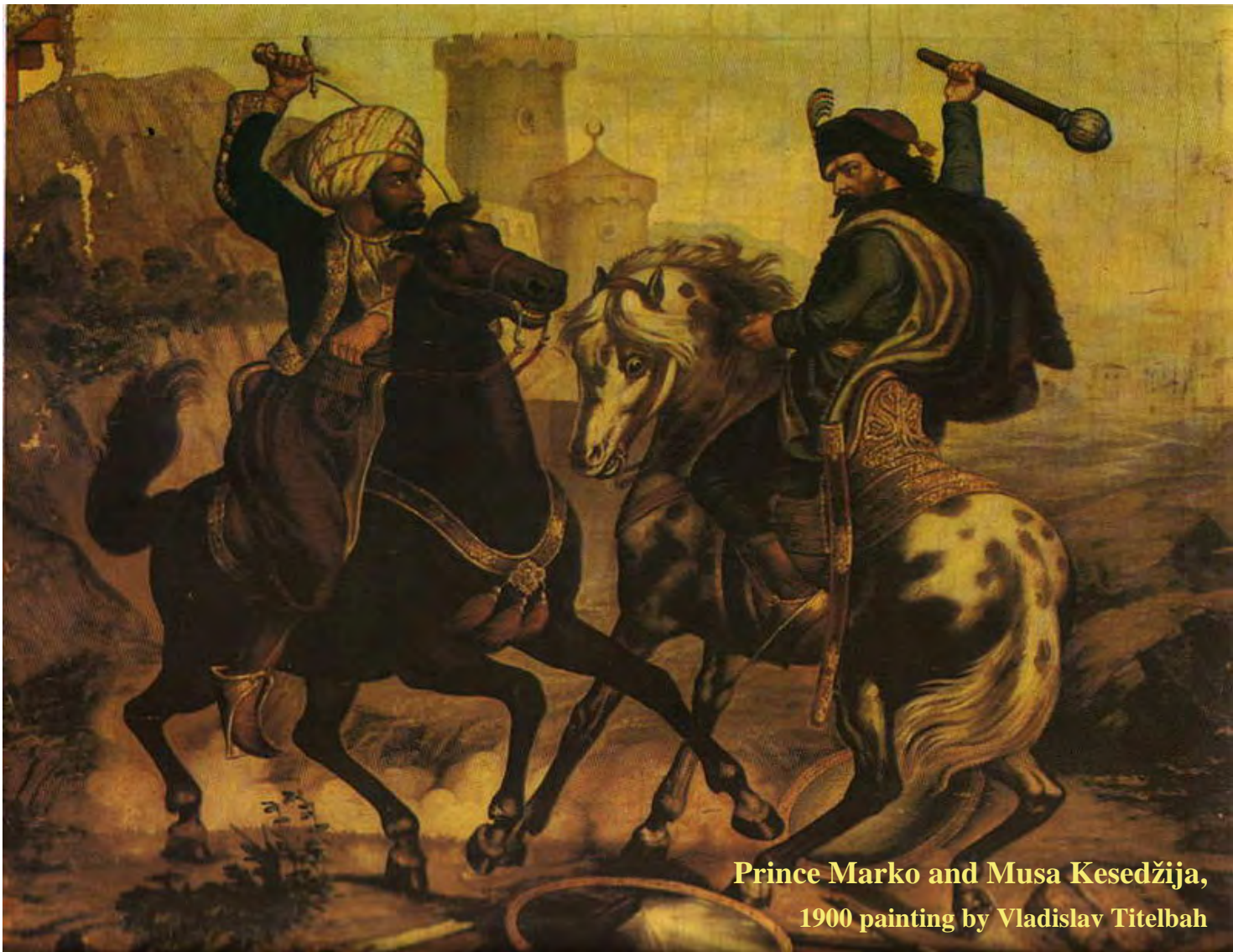
Prince Marko and Musa Kesedžija, 1900 painting by Vladislav Titelbah

I would like to begin my discussion of the significance of Krale Marko in Macedonian folklore with what might sound like an unrelated aside. I am sure that most of you, like myself, have had to endure the flood of public and both local and outsider's mockery and complaints about the recent monumental statuary and structures of downtown Skopje, and most particu-