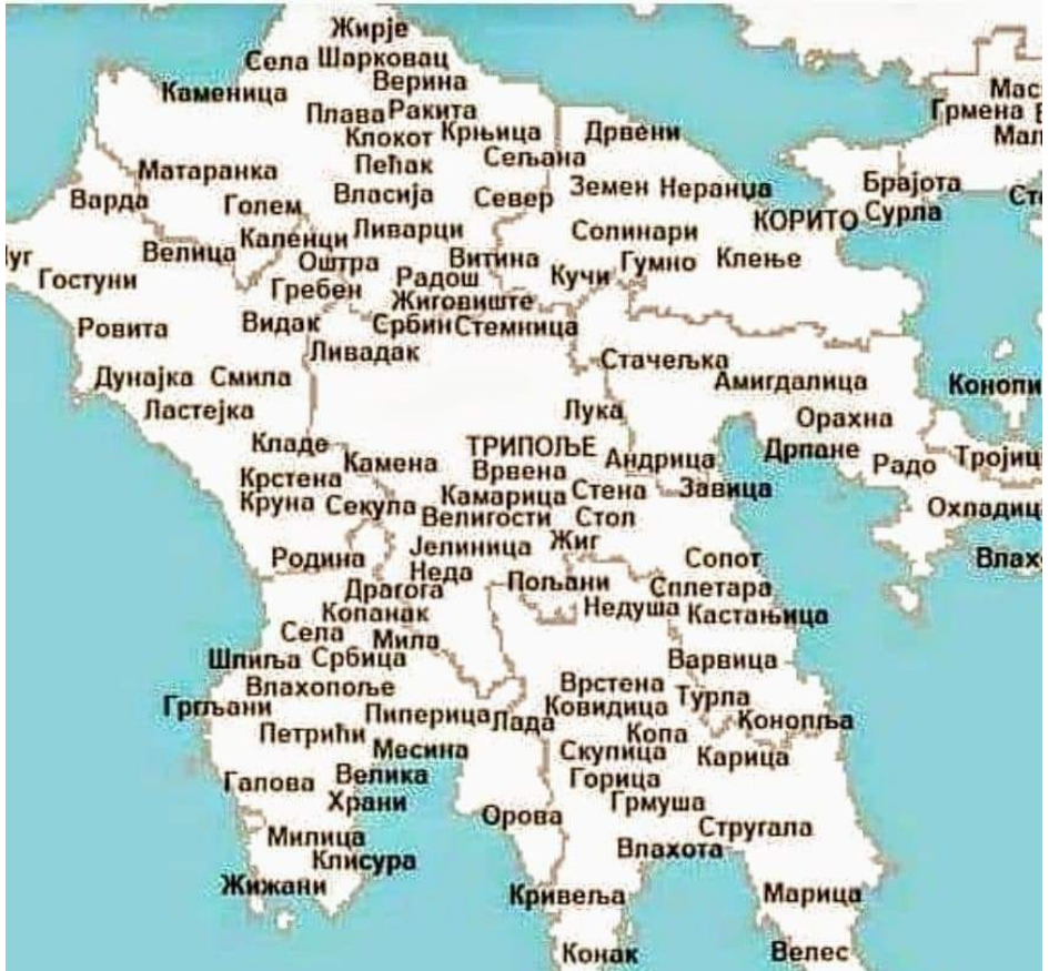
The toponymy Fallmerayer discovered in the Peloponnesus when Greece was first created