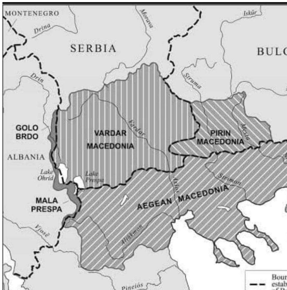
Ethnic Macedonia partitioned in 1913